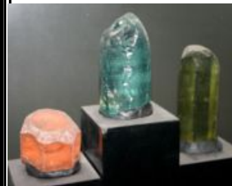
Three Beryl Crystals - Aquamarine rough crystal in the center.

lieved the siren's (mermaid) fish-like lower body was made of aquamarine.